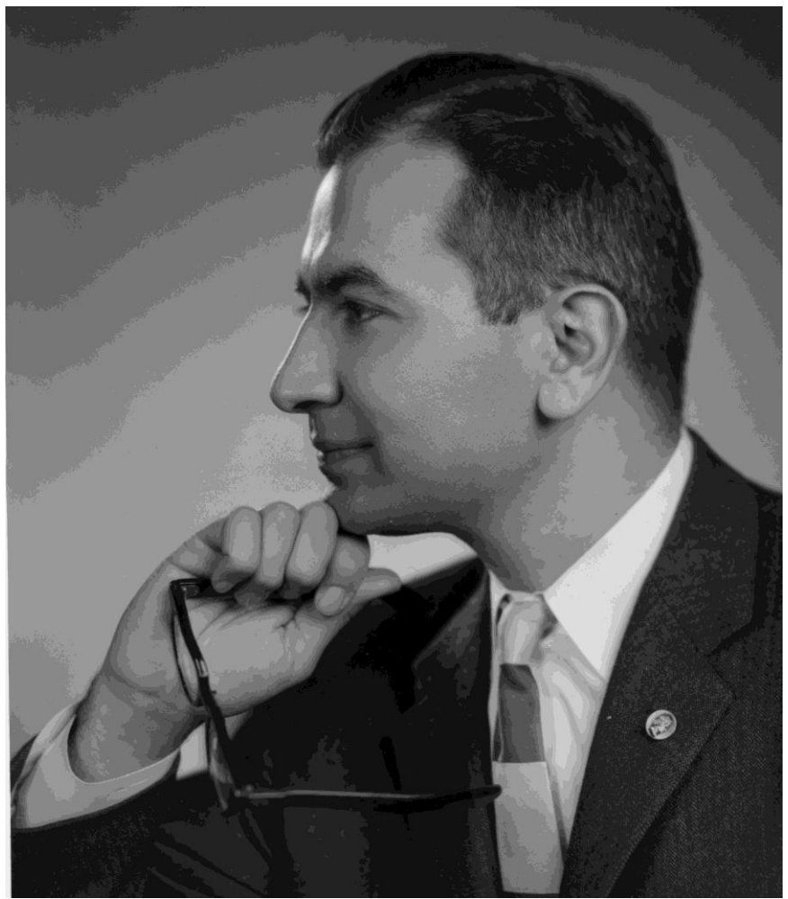
Thomas Saaty in 1959 - Age 33 in London while working at the US Embassy for the Office of Naval Research